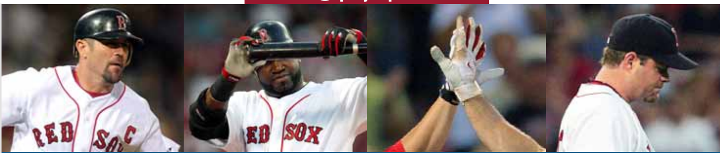
RED SOX, ORIOLES GET SEPTEMBER ROLLING : View the gallery at projosports.com/redsox

Tell us what you think at projosports.com/patriots