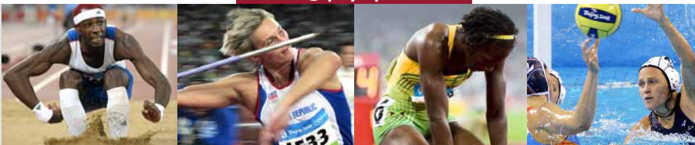
YESTERDAY'S ACTION AT BEIJING: View the gallery at projosports.com

Tell us what you think at projosports.com/redsox