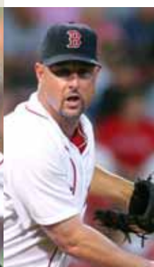
Tim Wakefield 7-8, 3.67