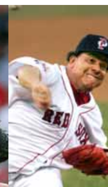
Bartolo Colon 4-2, 4.09