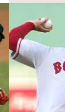
Clay Buchholz 2-9, 6.75