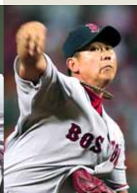
Daisuke Matsuzaka 15-2, 2.77