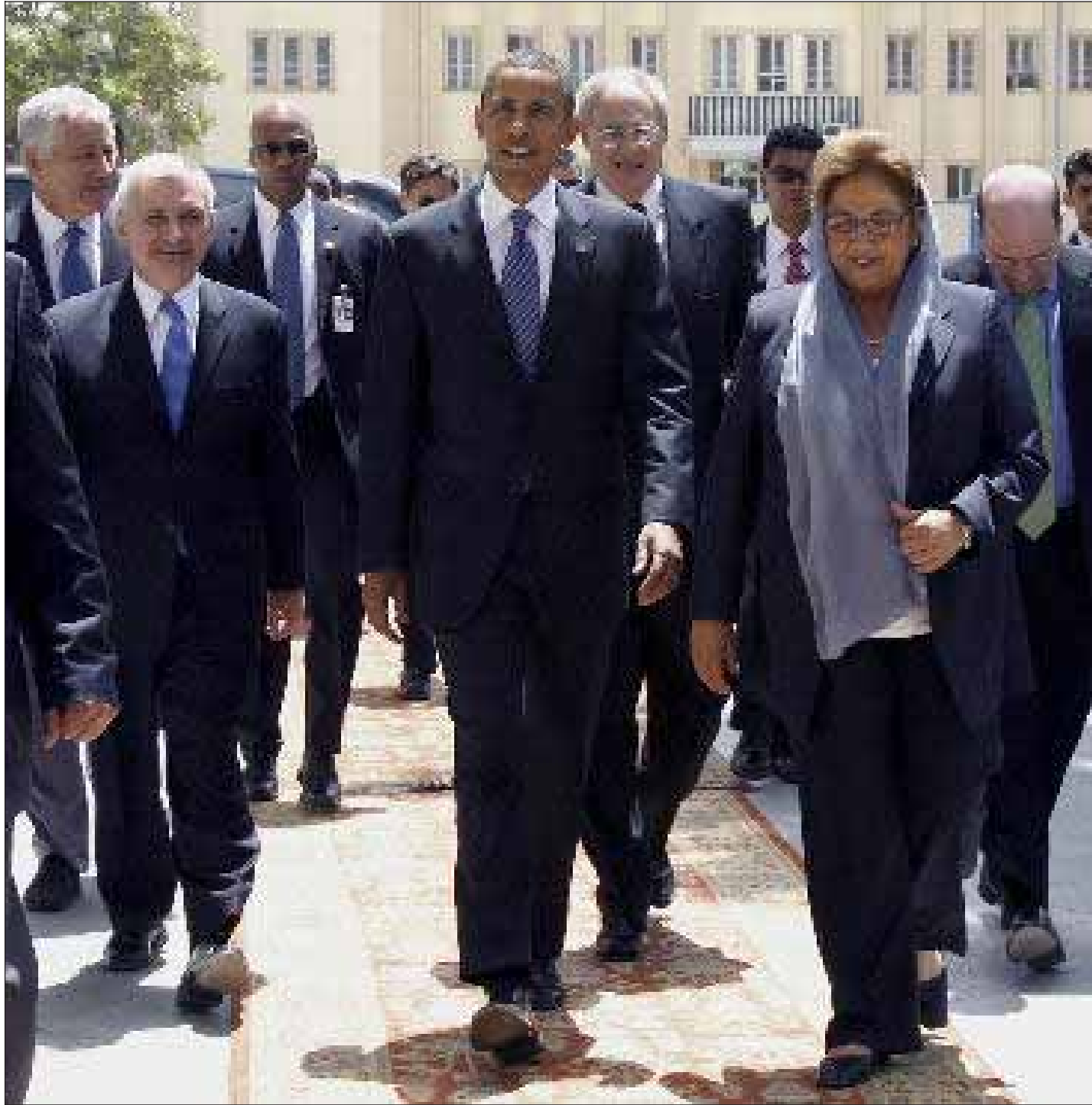
Accompanied by Rhode Island Sen. Jack Reed, left, and an unidentified Afghan official, right, Sen. Barack Obama arrives at the Presidential Palace in Kabul, Afghanistan, yesterday, for a meeting with President Hamid Karzai.

The Democratic presidential candidate says additional U.S. forces are needed to combat the Taliban and al Qaeda.