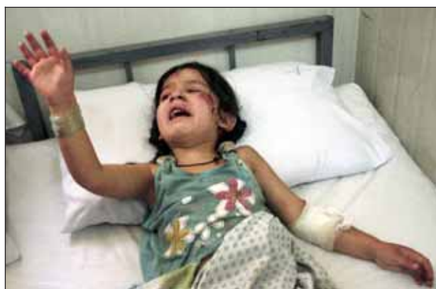
An Afghan girl being treated at a hospital in Kabul, Afghanistan, was one of the more than 130 people injured in yesterday's suicide bombing.

Among the victims of the attack, the first in seven years on a regional diplomatic mission in Afghanistan, were at least four Indian citizens: the Indian defense attache, a political counselor and two other Indian officials.