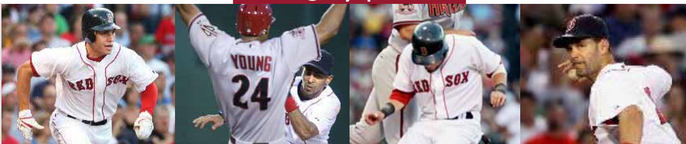
RED SOX WRAP UP HOMESTAND: View the gallery at Projosports.com/redsox

Tell us what you think at projosports.com/celtics