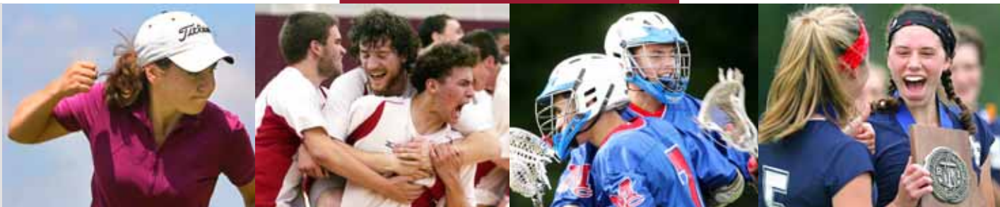
A LOOK AT SOME OF THE SPRING CHAMPS: View the gallery at HSGameTime.com/rhodeisland

Tell us what you think at projosports.com/celtics