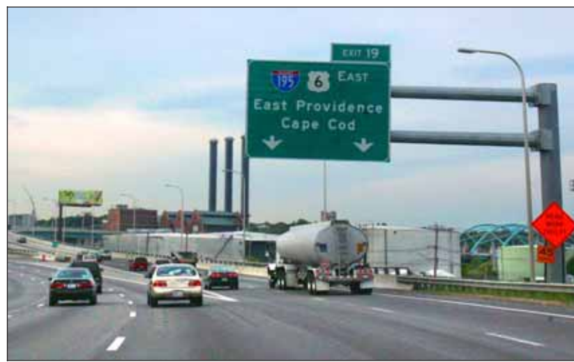
Starting Wednesday, motorists on Route 95 northbound seeking to travel eastbound will be required to take exit 19, which will take them over the new Providence River Bridge.