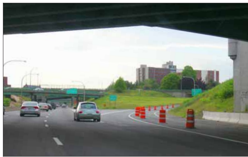
Exit 20 from northbound Route 95 leading to Route 195 will be closed Wednesday. The closure will also make Route 195 exits 1 and 2 on Route 195 into Providence inaccessible.