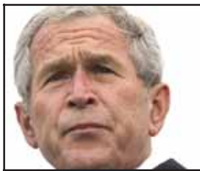
PRESIDENT BUSH, addressing the graduating class yesterday at the U.S. Air Force Academy

“We are once again facing evil men who despise freedom, and despise America, and aim to subject millions to their violent rule.”