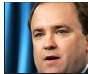
SCOTT MCCLELLAN, in What Happened: Inside the Bush White House and Washington’s Culture of Deception

But none have been as close to the center of power