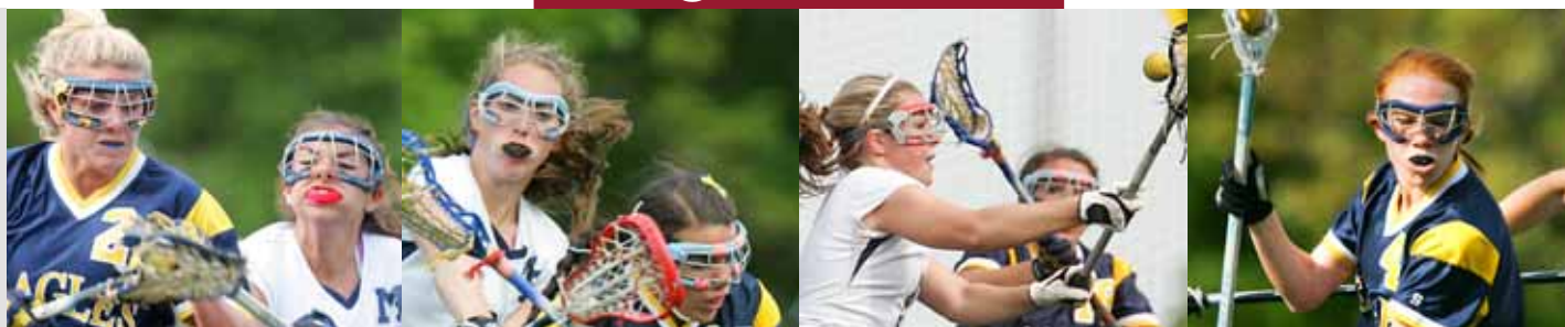
LACROSSE SHOWDOWN I GOES TO EAGLES: View the gallery at HSGameTime.com/rhodeisland

Tell us what you think at projosports.com/redsox