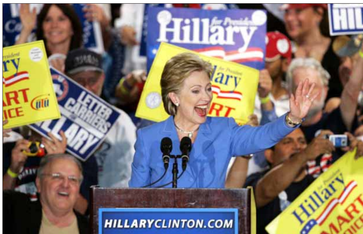
AP / DARRON CUMMINGS, above; AP / JAE C. HONG, below

Sen. Hillary Rodham Clinton, above, greets supporters at a rally last night in Indianapolis, after it appeared she narrowly won that state's Democratic presidential primary. Sen. Barack Obama, below, greets supporters in Raleigh, N.C., last night after winning that state's primary vote.