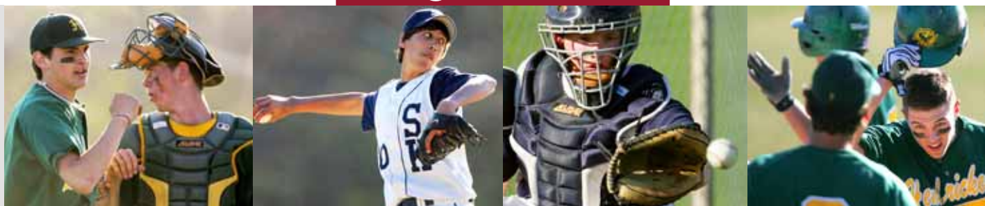
HENDRICKEN NINE SUBDUES SOUTH KINGSTOWN: View the gallery at HSGameTime.com/rhodeisland

Post your comment at projosports.com/redsox