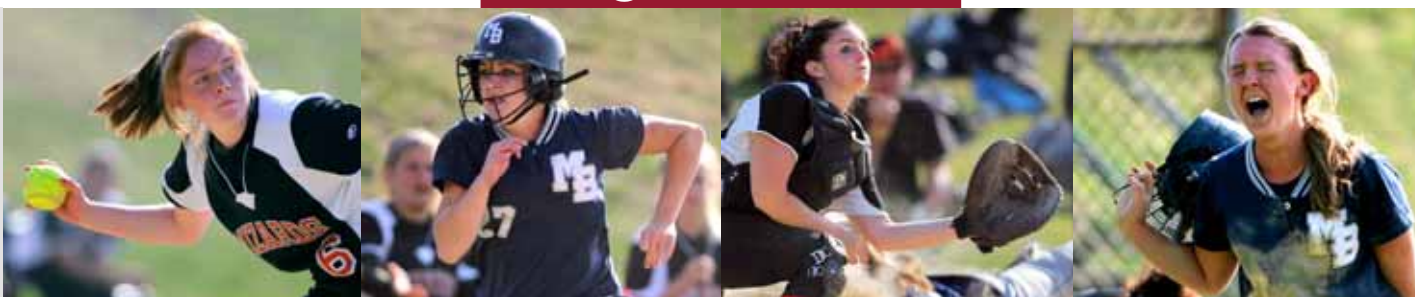
MOSES BROWN TOPS WEST WARWICK: View the gallery at HSGameTime.com/rhodeisland