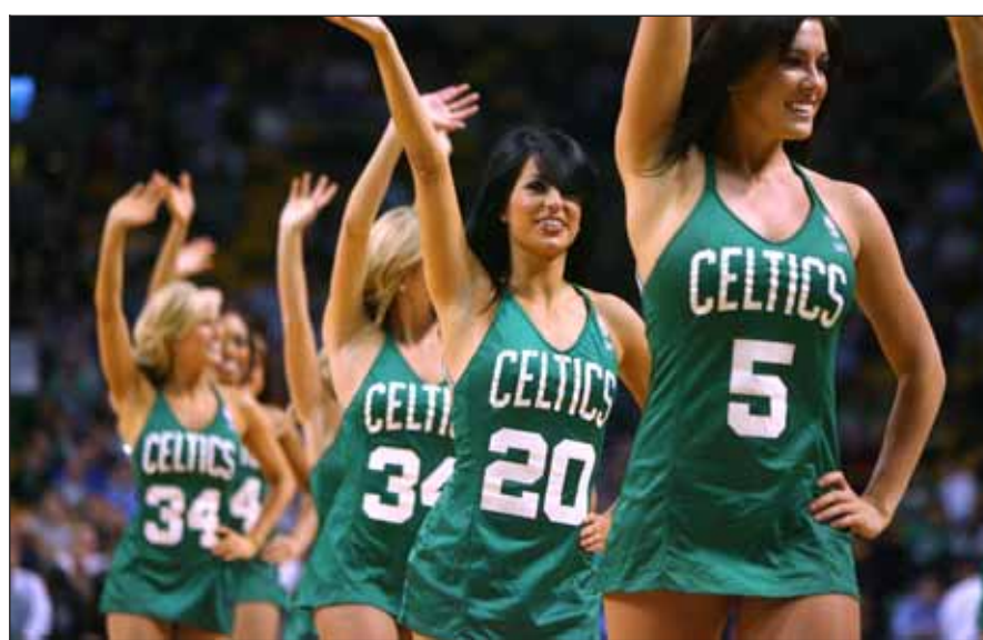
Whether it's Kevin Garnett leading a cheer on the Jumbotron, top, or cheerleaders dancing on the parquet, a Celtics game has it all. For a slide show of the pregame extravaganza, go to: projosports.com/celtics .

Rest assured these are not your father's Celtics anymore.