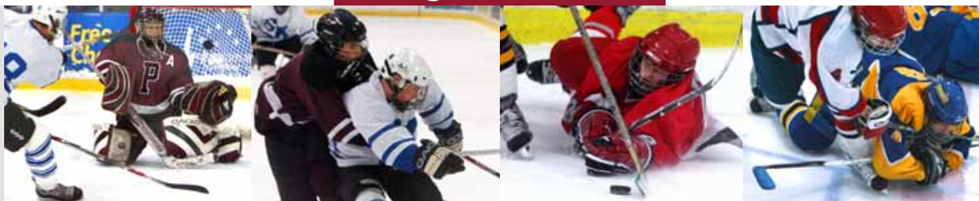
SCHOOL HOCKEY SEMIFINALS WRAP UP : View the gallery at HSGameTime.com/rhodeisland

Send in your comments at projosports.com/pc