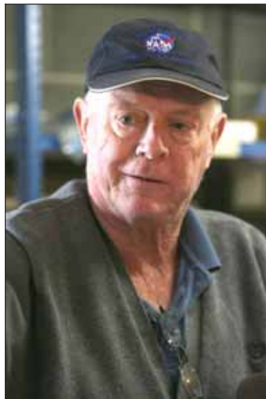
SEE RESPONSE, B2