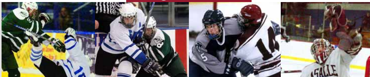
GAME-THREE THRILLS ON THE ICE: View the gallery at HSGameTime.com/rhodeisland

Give us your take at projosports.com/redsox