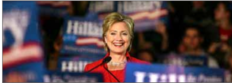
N.Y. Sen. Hillary Rodham Clinton's campaign is revived.