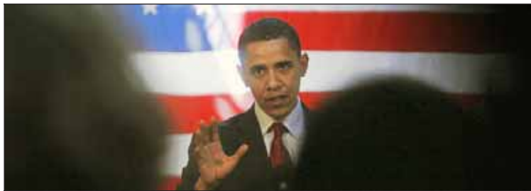
Ill. Sen. Barack Obama's Providence rally didn't seem to help.