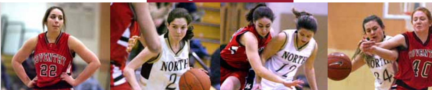
NORTH KINGSTOWN UPSETS COVENTRY: View the gallery at HSGameTime.com/rhodeisland