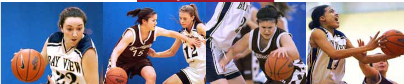
BAY VIEW RALLIES PAST STONINGTON: View the gallery at HSGameTime.com/rhodeisland

Tell us what you think at projosports.com/redsox