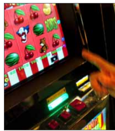
Sources: Twin River, Newport Grand, Rhode Island State Lottery

Twin River 4,752 slot machines Revenue to state: $208.1 million* Increase with 24-hour operation: $16.5 million Newport Grand 1,070 slot machines Revenue to state: $47.3 million* Increase with 24-hour operation: $3 million *Fiscal year 2007