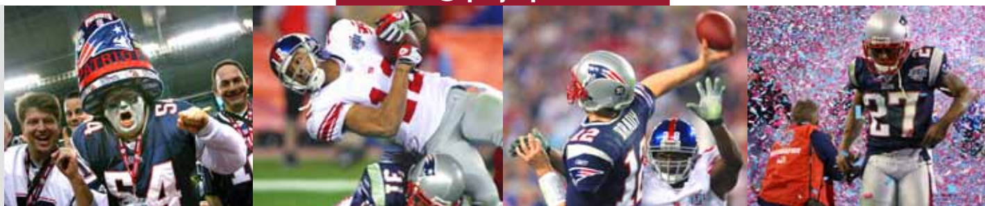
PERFECT SEASON COMES TO SCREECHING HALT: View the gallery at projosports.com/patriots

Tell us what you think at projosports.com/patriots