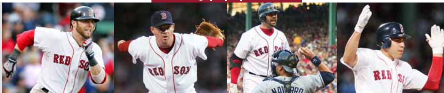
GAME THREE GOES RAYS' WAY: View the gallery at projosports.com/redsox