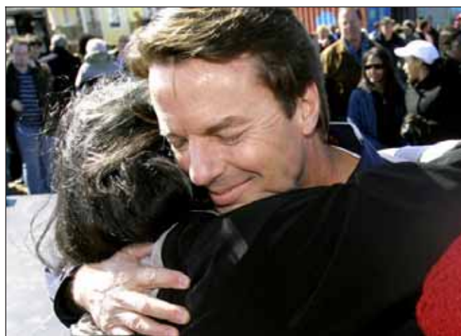
Democrat John Edwards greets a supporter after announcing his withdrawal from the presidential race yesterday in New Orleans.