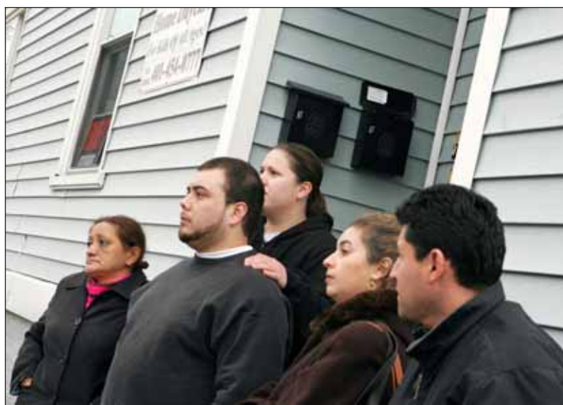
Neighbors watch as police investigate the Blackstone Street house where three bodies were found.