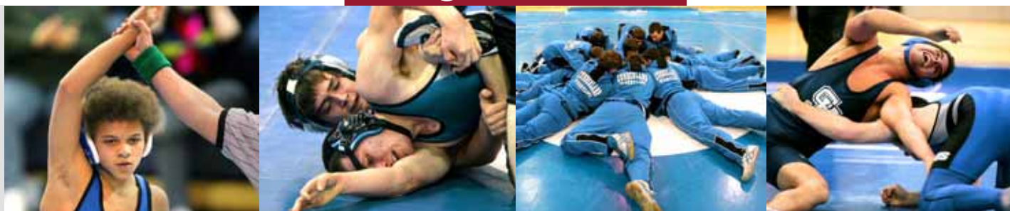
CUMBERLAND WRESTLERS DOWN S. KINGSTOWN: View the gallery at HSGameTime.com/rhodeisland

Tell us what you think at projosports.com/patriots