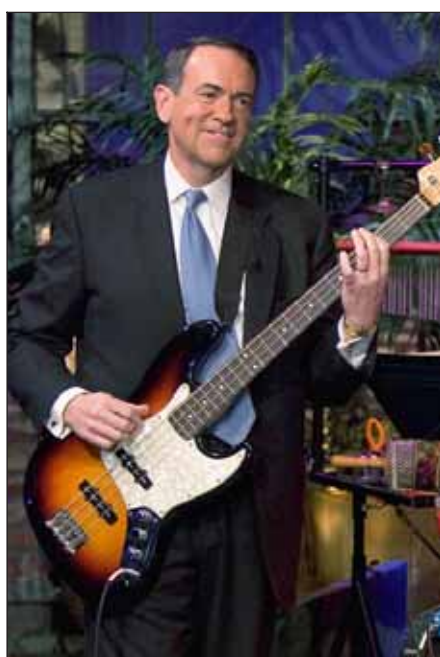
Mike Huckabee, the former Republican governor of Arkansas, on The Tonight Show with Jay Leno last night.

But even as they closed out their Iowa campaigns, some of the candidates began turning their attention to the East Coast, where New Hampshire's primary will take place just five