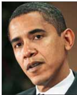
Barack Obama - D

The final step, where the secretary of state certifies the legitimacy of the submitted signatures.