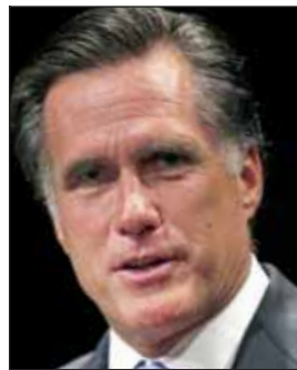
Mitt Romney - R