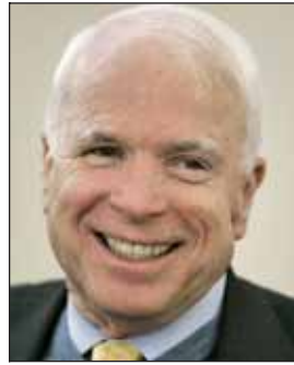
John McCain - R