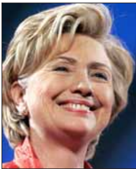
Hillary Clinton - D

An intermediate step, where local boards of canvassers tally the number of signatures submitted and determine that they are eligible voters.