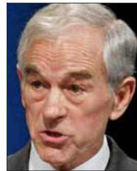
Ron Paul - R