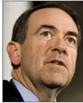
Mike Huckabee - R