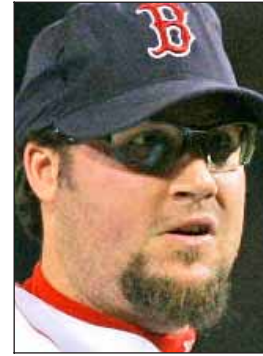
ERIC GAGNE: Allegedly had HGH sent to him at Dodger Stadium.