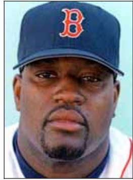
MO VAUGHN: Allegedly bought human-growth hormone.