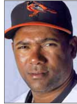
MIGUEL TEJADA: Allegedly received drugs from a teammate.