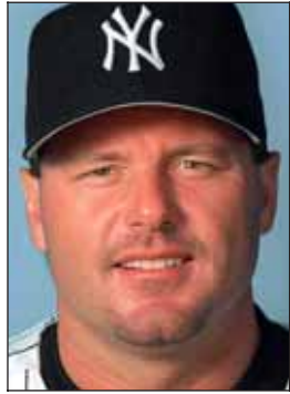
ROGER CLEMENS: His former trainer details extensive steroids use.

projo.com Your turn: Would you vote to elect Roger Clemens to the Hall of Fame? To respond, go to projosports.com/redsox