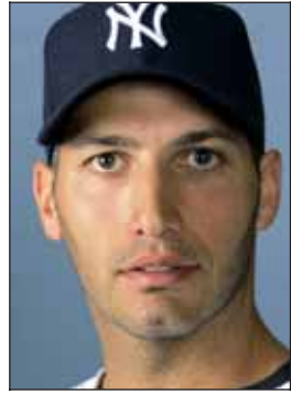
ANDY PETTITTE: Allegedly used HGH for an elbow injury.