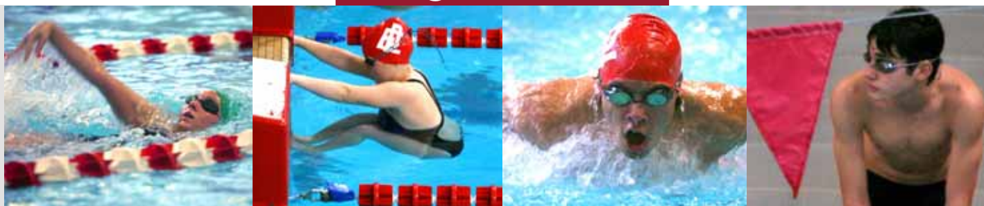
BARRINGTON TOPS EAST PROVIDENCE: View the gallery at HSGameTime.com/rhodeisland

Check out our bulletin boards at projosports.com