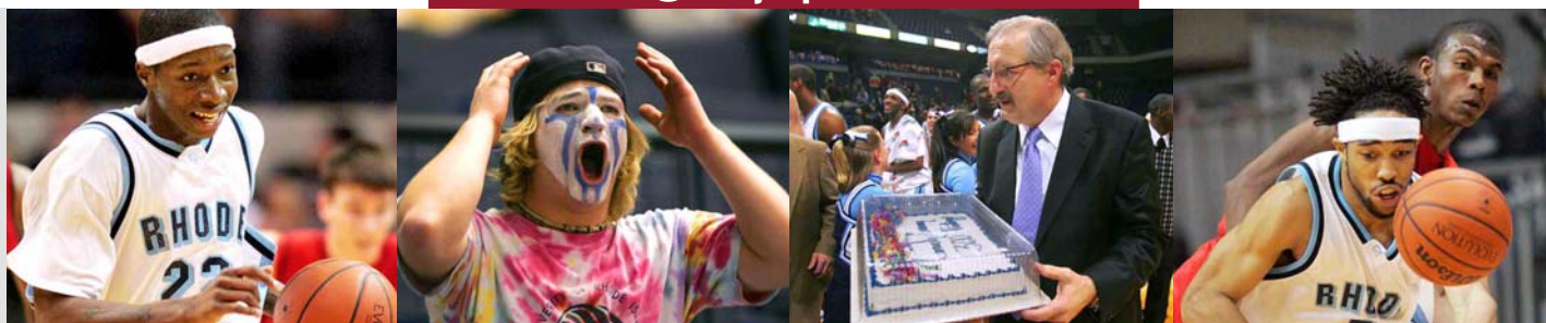
URI FIVE ROLLS AGAINST NORTHEASTERN: View the gallery at Projosports.com/uri