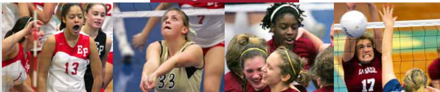
EAST PROVIDENCE, LA SALLE ADVANCE: View the gallery at HSGameTime.com/rhodeisland

Tell us what you think at projosports.com/redsox