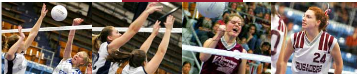
DIVISION II VOLLEYBALL FINALISTS SET: View the gallery at HSGameTime.com/rhodeisland

Take the survey at projosports.com/redsox