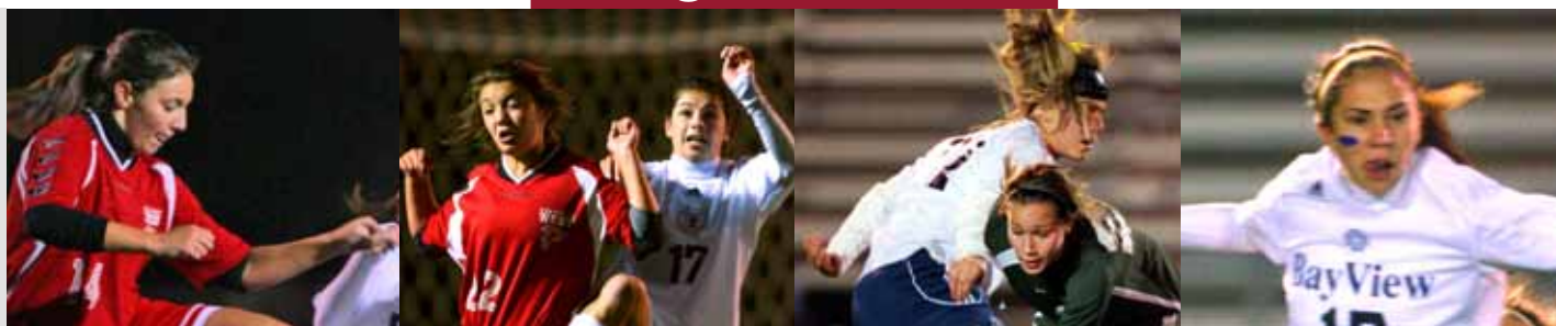
CRANSTON WEST, BAY VIEW ADVANCE: View the gallery at HSGameTime.com/rhodeisland

Answer our survey at projosports.com/redsox