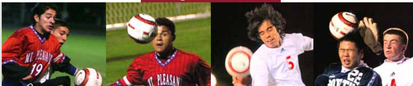
SOUTH KINGSTOWN, PILGRIM BOOTERS ADVANCE: View the gallery at HSGameTime.com/rhodeisland

Tell us your guess at projosports.com/celtics