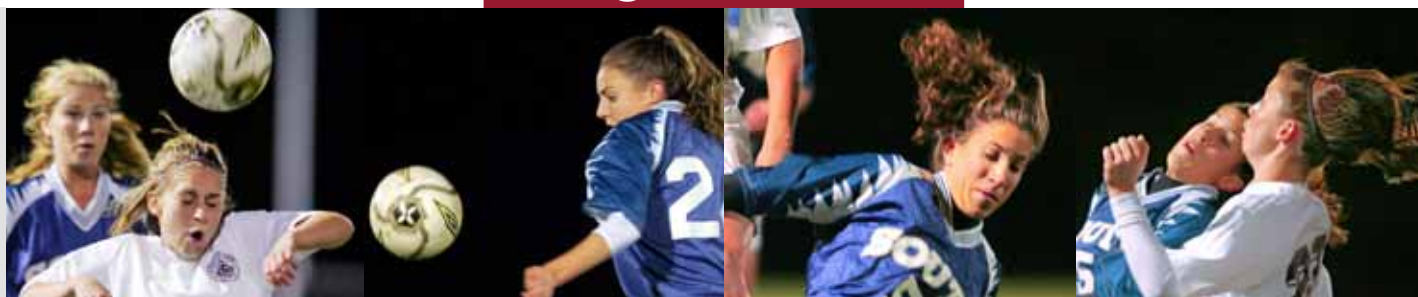
RAMS ELIMINATE REBELS IN GIRLS SOCCER: View the gallery at HSGameTime.com/rhodeisland

Place your vote today at projosports.com/uri