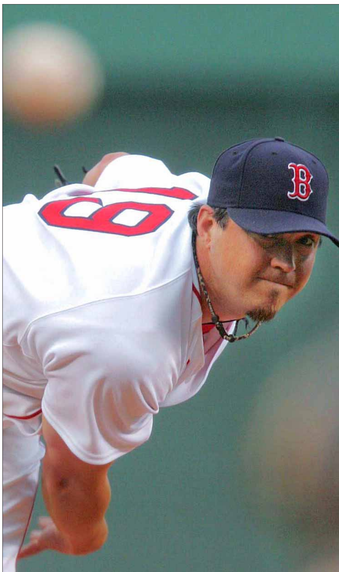
RED SOX GAME ONE STARTER JOSH BECKETT