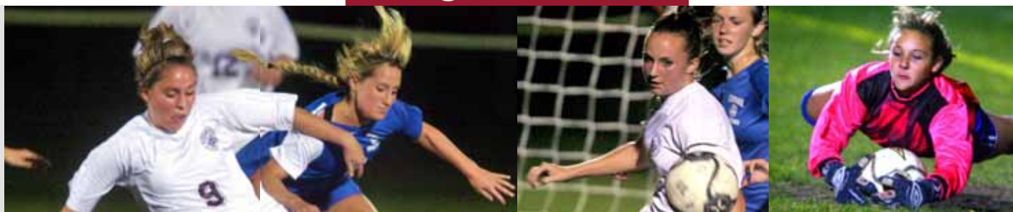
UNBEATEN LA SALLE DOWNS SCITUATE: View the gallery at HSGameTime.com/rhodeisland

Say what it's worth to you at projosports.com/redsox